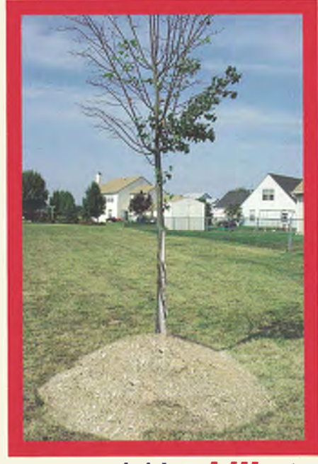
Improper mulching kills trees!

Fresh grass clippings or fresh wood chips Any fresh organic mulch Any organic mulch that smells bad Peat moss or sawdust Pebbles, rocks, or cobble stones Bricks or pavement or black plastic Ground-up rubber tires